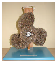
Quagga encrusted prop from Lake Mead PRO1 - unmounted PRO1(M) - mounted