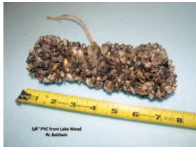
Quagga encrusted \frac{3}{4} " PVC from Lake Mead PVC01