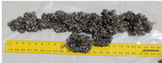
Quagga heavily encrusted rope from Lake Mead RPH1