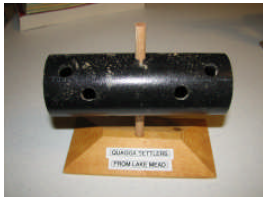
Quagga settler encrusted ABS pipe from Lake Mead ABSV01M - mounted