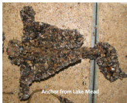
Quagga encrusted anchor from Lake Mead AN01 - unmounted AM01M - mounted