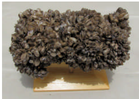
Quagga heavily encrusted ABS pipe from Lake Mead ABS02M - mounted