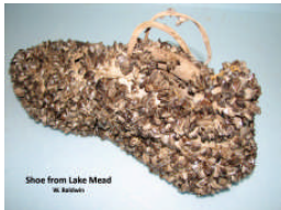
Quagga encrusted shoe from Lake Mead SH01 – unmounted SH01M - mounted (Mounted is on stand similar to ABS mounting above)