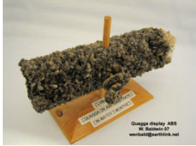
Quagga encrusted ABS pipe from Lake Mead ABS02M - mounted