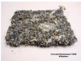
Quagga encrusted cement backer board from Lake Mead CB01