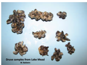
Quagga druse samples from Lake Mead DR01