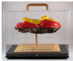
Quagga encrusted 8" Toy boat from Lake Mead TB01M